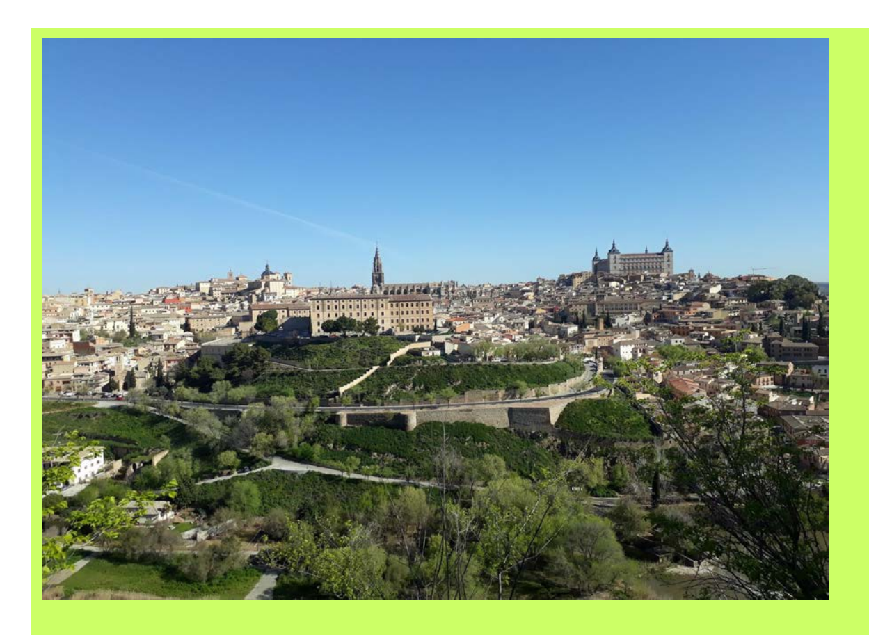
This is Toledo, the medieval armoury of Europe.