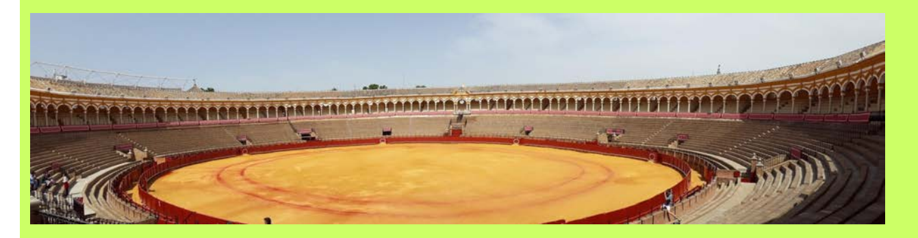
This is a bull ring that is STILL being currently used. We also met a 19 year old bullfighter at a school that we went to.