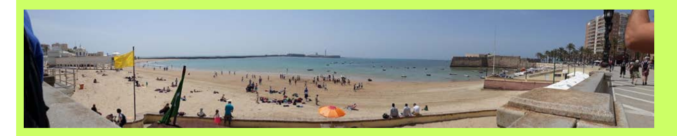
The only time we got to see a beach was in Cadiz (southern Spain). Out in the distance you can actually see a castle in the water.