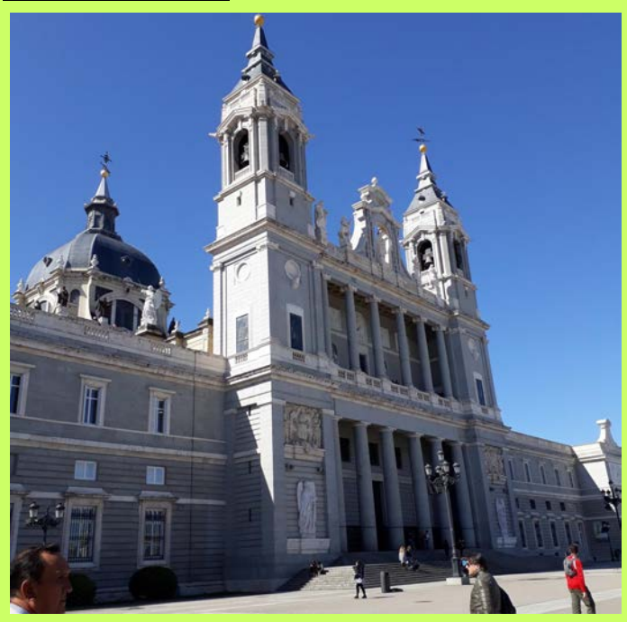
A church in central Madrid